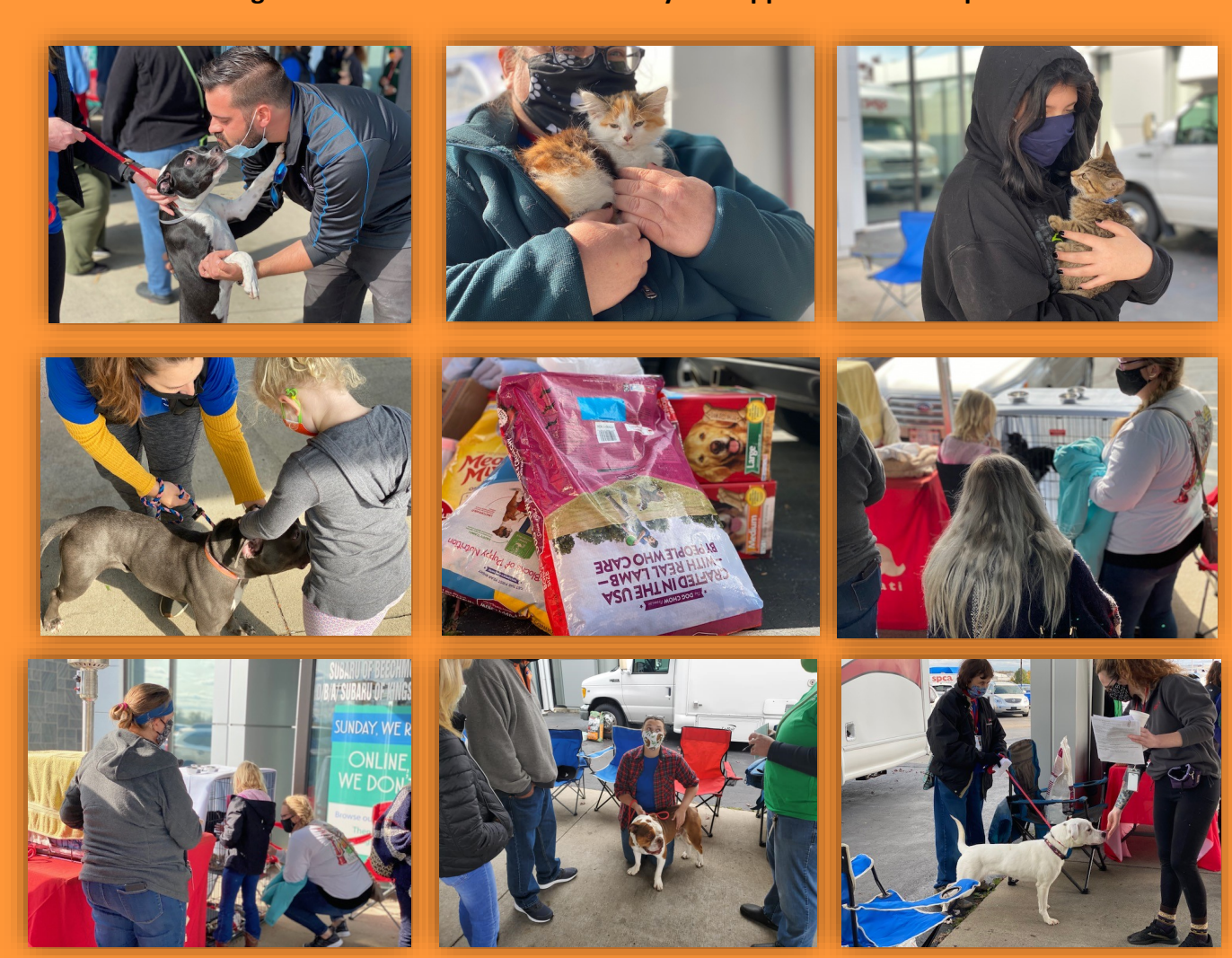
We look forward to finding more forever homes at next year's Subaru Loves Pets adoption event!!

Another huge shout out to our volunteers for your support with this important event!